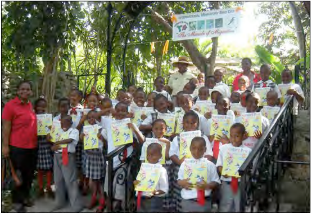
After lecture and field trip at Garden of the Groves, students from Maurice Moore Primary School receive a high quality, educational colouring book featuring 41 beautiful drawings of migratory birds that occur in the Caribbean along with brief text about each species.