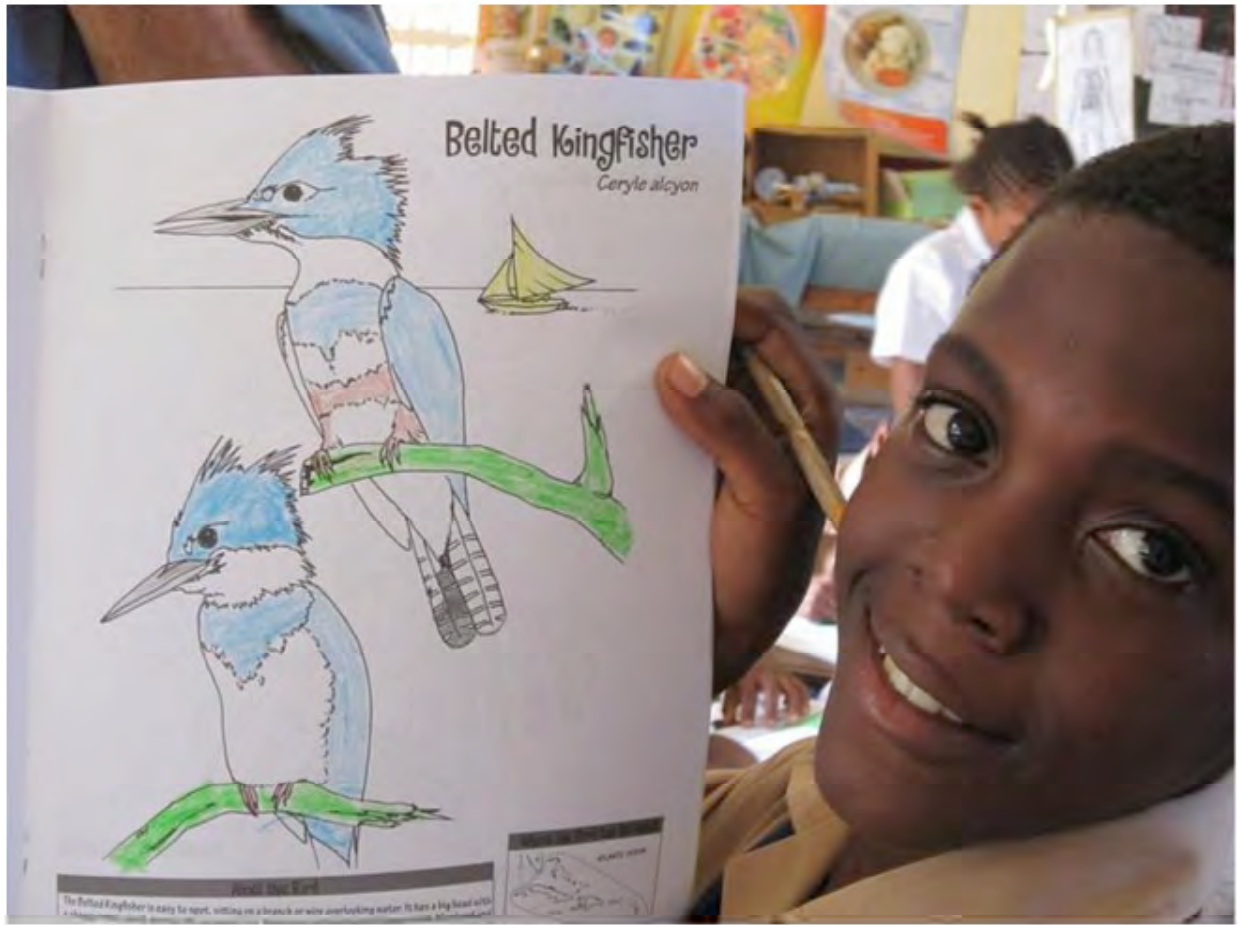
Showing off some colouring, student at Robins Bay Primary School, Jamaica. All students received a copy of the new Migratory Birds of the West Indies colouring book – they were very popular!