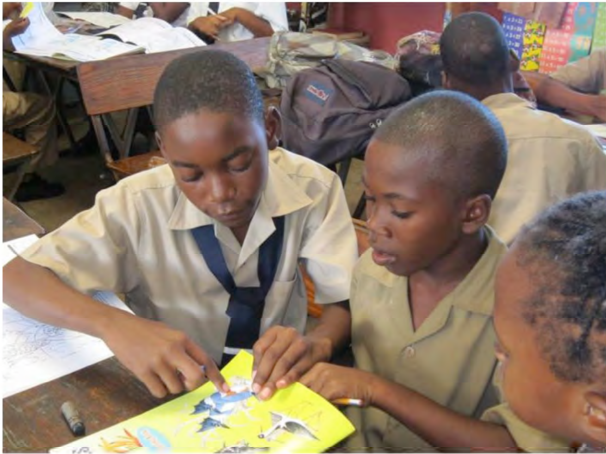
☛ Checking out the new Migratory Birds of the West Indies colouring book, students at Robins Bay Primary School, Jamaica

From the album: IMBD 2010 by Caribbean Bird Festivals – CEBF & IMBD